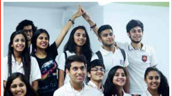
ISDI Student Life