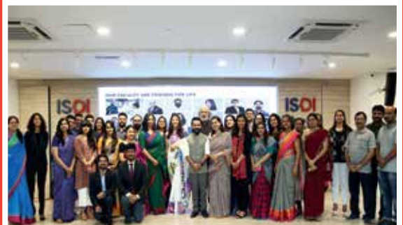
World-class Faculty at ISDI