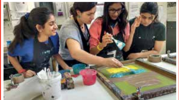
ISDI Summer Abroad