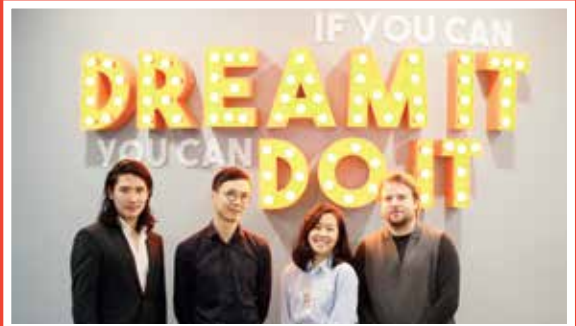
Parsons Faculty at ISDI